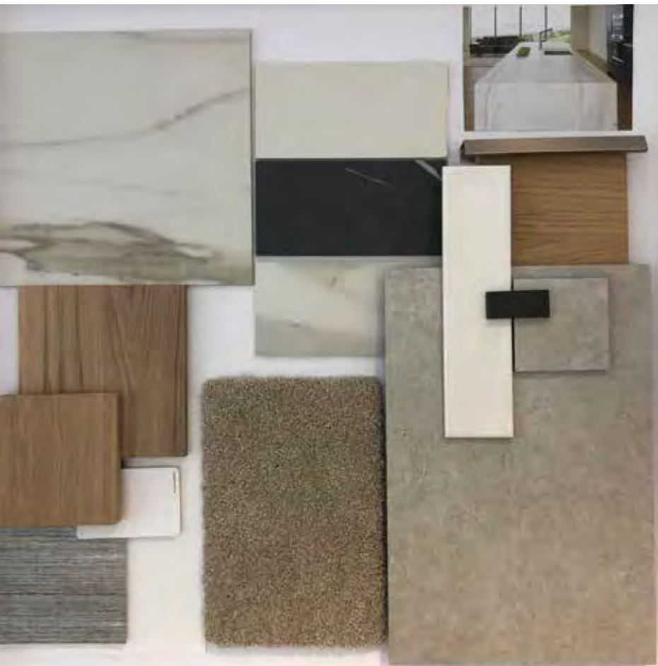
The mood boards are concepts of what is proposed